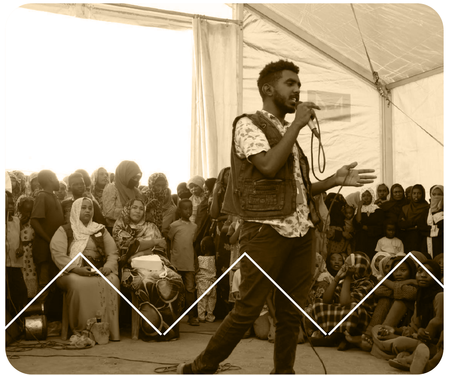
Food Baskets Distributed.. The Al-Muglad Youth Center Emergency Room